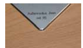
external radius 2mm with radius R5