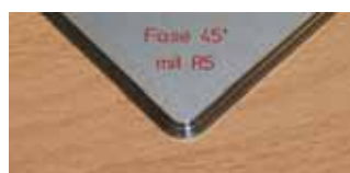
45° chamfer with radius R5