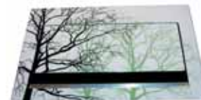
Design example "Decor"