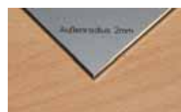
external radius 2mm