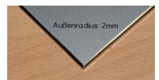
outside radius R2/pointed

This product can be individual customized with WinPlan2 !!! Your personal price! Automatic generated!