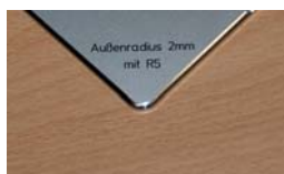
outside radius R2/radius R5