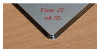
chamfer 45°/radius R5