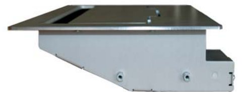
side view Hybrid Slim T-315