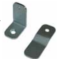
Picture: Mounting bracket for horizontal mounting